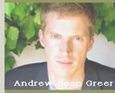
Andrew Sean Greer

HOME | WHO WE ARE | HISTORY | MISSION | MEMBERSHIP | YOUNG WRITERS CONTEST | CONTACT US