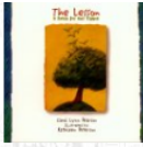
The Lesson: A Fable for Our Times