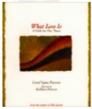
What Love Is: A Fable for Our Times