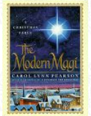
The Modern Magi