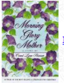
Morning Glory Mother Synopsis/reviews