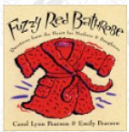
Fuzzy Red Bathrobe