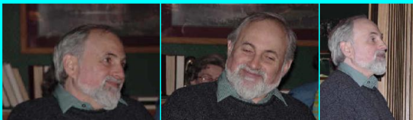
Some members and guests