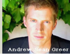
Andrew Sean Greer

"PYRAMID TIPPING: HOW TO BUILD GREAT FICTION AND NONFICTION CHARACTERS FROM THE TOP DOWN"