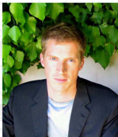
Andrew Sean Greer

Holiday Inn in Concord Click here for a few photos